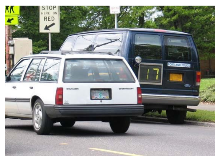
Figure 1 shows an example mobile SSC unit with the additional benefit that the unit (equipped police van) provides instantaneous speed feedback to the drivers. Agencies that used fixed unit systems may even install "dummy" housings at various sites to give the appearance of widespread, overt enforcement or may rotate systems between housings to increase the locations the program can cover.

Mobile, fixed, or P2P enforcement systems can be used with either overt or covert enforcement strategies. Although SSCs should not be used as a long-term solution to engineering problems, fixed, visible cameras may be the most viable solution to curb significant speeding problems at certain types of locations or before engineering improvements can be implemented. Conversely, if speed is a network-wide (or corridor-wide) concern, mobile units that can be shifted from site to site or P2P may be well-suited.